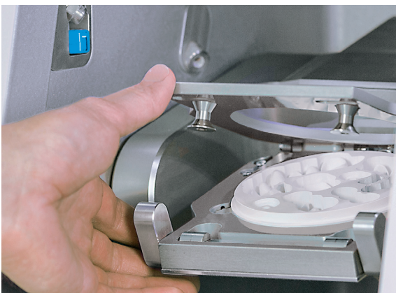
One-handed clamping made possible by DirectDiscTechnology